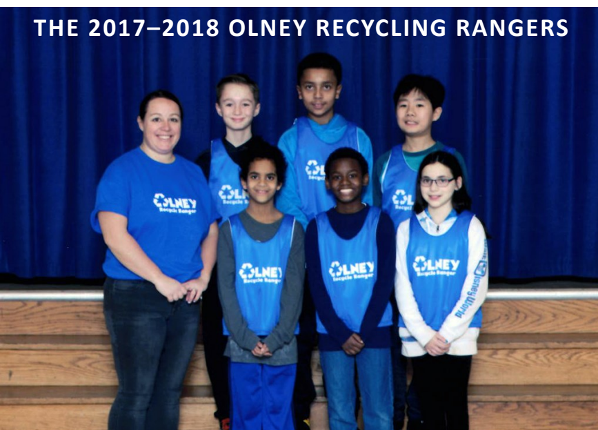
THE 2017-2018 OLNEY RECYCLING RANGERS

For more information about implementing a successful school-based SERT program at your school, please click here .