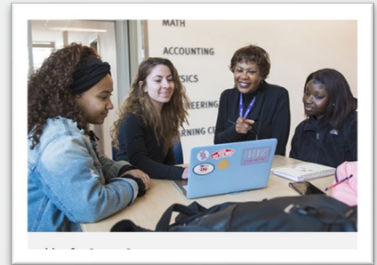
ATPA Academic Coaches